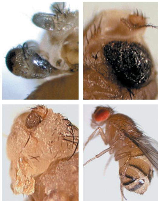
The mutations responsible for these flies' deformities are present in normal-looking flies, but their effects are usually hidden by 'chaperone' proteins.